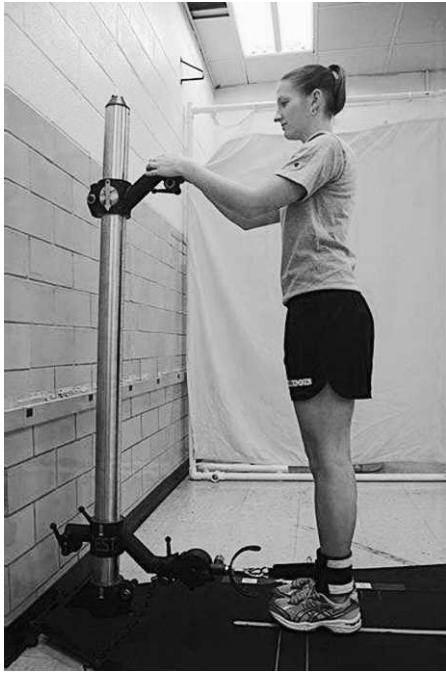
Figure 3. Standing strength protocol.

Standing Isometric Strength Protocol. The ADs, ABs, HFs, and HEs were assessed with the participant in a standing position. He or she was placed in standing position with the feet shoulder-width apart and the load cell attached to the appropriate anatomical aspect (anterior, posterior, lateral, or medial) of the lower leg proximal to the medial malleolus via an ankle cinch strap. The participant was then instructed to push or pull in the direction opposite the attachment of the load cell (Figure 3).