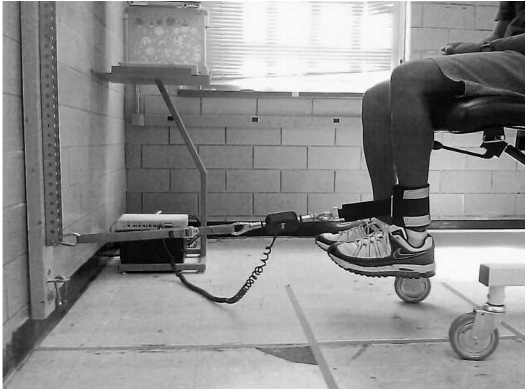
Figure 2. Seated strength protocol.

scripted instructions for the participants, which the raters used to explain the requirements of the evaluation to them. The participants received no forms of verbal or visual encouragement other than these instructions. The instructions for the seated strength measures were as follows: “(1) You will receive 1 practice and 3 test trials, (2) You will perform a 5-second contraction with a 10-second rest period, (3) Make sure you give maximum effort, (4) Sit up tall, (5) Arms across your chest, and (6) Begin on the computer’s command.” Immediately after item 6 (“Begin on the computer’s command”), the rater stated, “Push, push, push,” or “Pull, pull, pull,” depending on the assessment. The instructions for the standing strength measures were similar except for item 4, in which “Sit up tall” was replaced with “Stand up tall.”