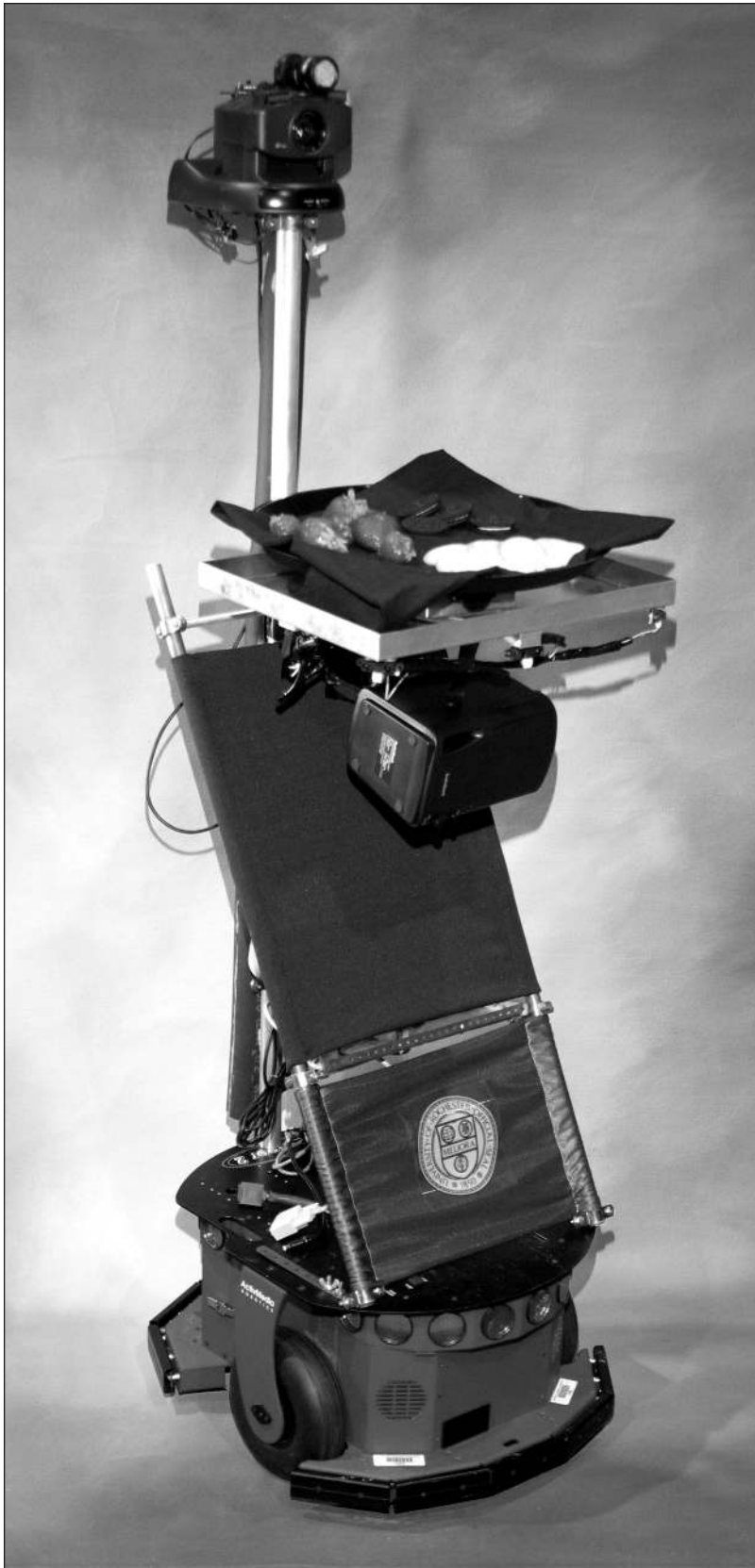
Figure 3. MABEL, the Mobile Table from the University of Rochester.

in unanticipated ways (such as clustering around, asking questions, or purposefully foiling the robot's attempts to move). This situation also makes navigation more difficult for the robots. Also, being in such noisy environmental conditions, it was hard for the teams to demonstrate vocal interactions with people. However, because the robots still have some limitations to overcome before becoming real servants, vocalization helps people focus on what the robots are trying to do as part of the interaction. Such problems have to be taken into consideration when we move robots out of the controlled conditions of research labs. The Robot Host event is a great opportunity to experiment in such a context. The event also serves as a common evaluation test bed for the different approaches used to implement the intelligent decision-making processes required by the autonomous robot servants.