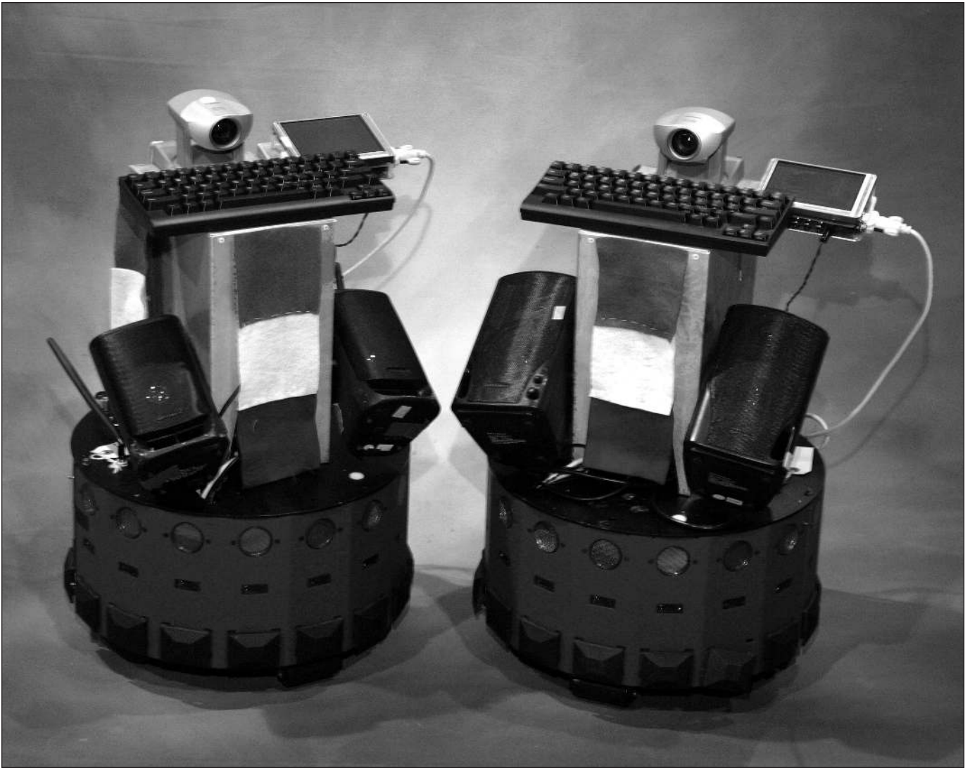
Figure 2. FRODO and ROSE.

face; the robots could use the shirt information in conversation with conference participants.