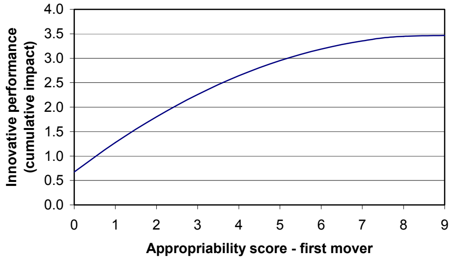
Figure 2: Predicted relationship between innovative performance and the first mover appropriability score of the firm