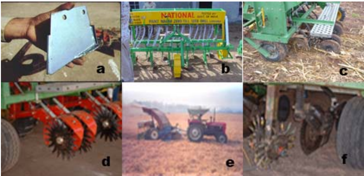
Figure 2: Various equipment for planting wheat no-till in RWC. a) inverted-T coultter; b) Indian no-till drill using inverted T; c) disk type planter; d) star-wheel punch planter e) “Happy planter” where straw picked up and blown behind seeder; f) disk planter with trash mover.