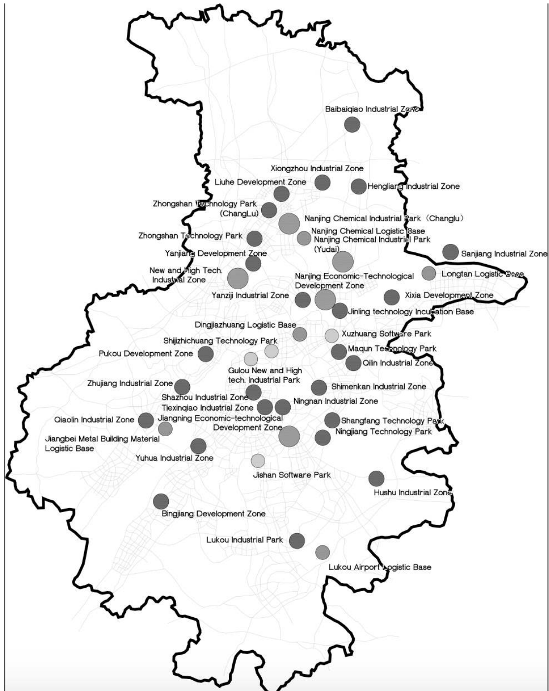
Figure 2. Dispersed industrial zones and parks in Nanjing. (Note: The status of the zones ranges from national industrial zones to town/district industrial zones).

In China's development, park fever and zone fever have been accompanied by administrative restructuring, a process in which central cities take over suburban land through annexing counties or towns. Nanjing is no exception. In the years 2000 and 2002, the city went through urban restructuring twice, which enlarged the city proper from 975 km 2 to 4720 km 2 . In this process, the construction of parks and zones co-occurred with the development of university towns, resulting in a government-led coexistence of high-tech grounds and academic fields. Showing Nanjing's ambition to be known as an innovation hub