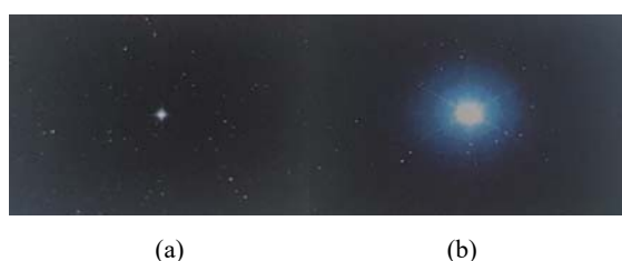
Fig. 2 Visual explanation of the difference between banjjak (반짝) (a) and beonjjeok (번쩍) (b)

Vowel ablaut, also known as vowel gradation, is one of the most common characteristics of ideophones in terms of sound symbolism. It consists of a systematic variation of vowels in order to slightly change the meaning of that word. For example, the ideophone banjjak (반짝), which is formed by light vowels, suggests something small and light that shines; while the ideophone beonjjeok (번쩍), where the light vowels have been changed into dark ones, depicts something big and heavy that shines.