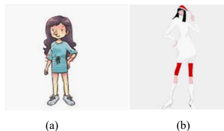
Fig. 6 Visual explanation of the difference between nalssin (날씬) (a) and neulssin (늘씬) (b)