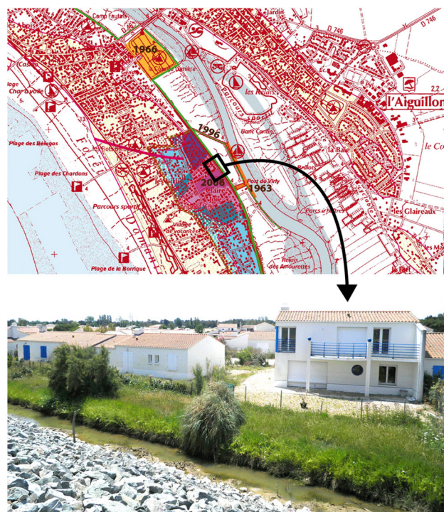
Fig. 2 Houses, such as these in La Faute-sur-Mer, were built deliberately in flood-prone areas

Storm Xynthia disclosed the desire of local authorities for site development, ignoring natural risks in spite of the information available on flood-prone areas. Figure 2 illustrates the coastal area of La Faute-sur-Mer and the continuous cultivation of the flood risk zone between the Lay River and the Atlantic Ocean. The building