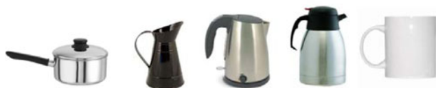
Fig. 1 (Top) Example stimulus displays (images not to scale). Left: High perceptual load, compatible (for subjects who responded to X with the left hand). Right: Low perceptual load, incompatible. (Bottom) The five distractor objects used in the experiment, with left handles. In half of the trials, the images were mirror reversed to have right handles

120 trials, resulting in a total of four experimental blocks and 480 trials.