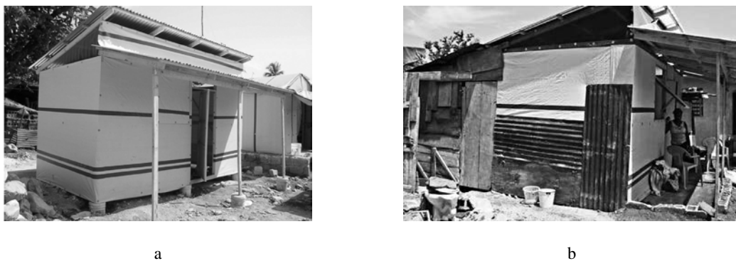
Figure 6 - Units modifications: (a) temporary housing unit before being used and (b) after the user modifies it.

and Altum, 2009). Likewise, in post-disaster scenarios the house is often a family workspace (Kellett and Tipple, 2000), and those modifications are essential to facilitate the creation of appropriate spaces for that. Using local materials and building technologies allow people to introduce modifications, which makes maintenance easier and more economical, in order to improve the long-term possibilities of the constructions. Despite the criticism to the new modern ways of production used to build temporary accommodation buildings, and the emphasis on the usage of local resources, it does not mean that innovation has no space in the development of temporary solutions. Properly used, that is to say culturally and locally integrated, innovation and technology may contribute in a useful manner to improve temporary accommodation solutions (Shaw, 2009; Davidson et al, 2008; Garofalo and Hill, 2008). Therefore, the design should balance a combination of technological and local ways of construction and materials (Félix et al, 2013c).