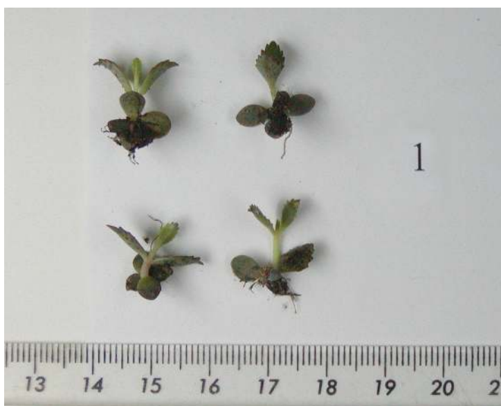
Figure 4. Buds (1) visible formed new leaves (shaking of water leads to the growth of plants).

V. I. Vernadsky called the mineral water as a creator of landscape and processes on the planet. Movement of water to create products that affect the physical properties, gives life, heals, nurtures, creates geological masterpieces, mountains and continents, and mighty rivers in the rocks, the threat of a tsunami, move the continents, currents that regulate the planet’s climate. The role of water and its movement in geological processes is huge. In [9] [10] [11] observed the constancy of the H_2O_2 content in rain waters from different areas of the US with all sorts of atmospheric composition with significant differences in content