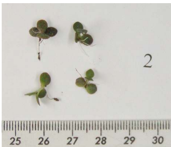
Figure 5. Buds (2) of Kalanchoe—control experience. Water without shaking.