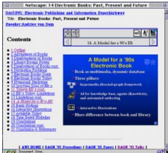
Figure 2: The DAGS95 Presentation Interface — a WWW/HTML based interface for presentations with audio and slides.

The current design of the WWW has insufficient support for annotations. Given the preeminence of annotations and linking among the discussions of hypertext, it seems odd that neither HTML nor current WWW browsers provide any real support for shared annotations or user-links being added to existing documents. This lack makes HTML inconvenient for true hypertext publishing. Fortunately, researchers are developing extended browsers and support systems for shared annotations [Röscheisen, Mogensen, Winograd 1995].