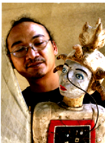
Figure 1. Heri Dono

In a career spanning more than three decades, Heri Dono has consistently displayed aesthetic idiolects – according to Umberto Eco, aesthetic idiolects can be understood as the personal style of an artist – that gained him a position as a contemporary Indonesian artist involved in a variety of important international exhibition activities, such as biennials, triennials and international activities. Up to 2006 he was included in eight major international art events; noted as the most regularly featured artist (Ingham, 2007: 2)