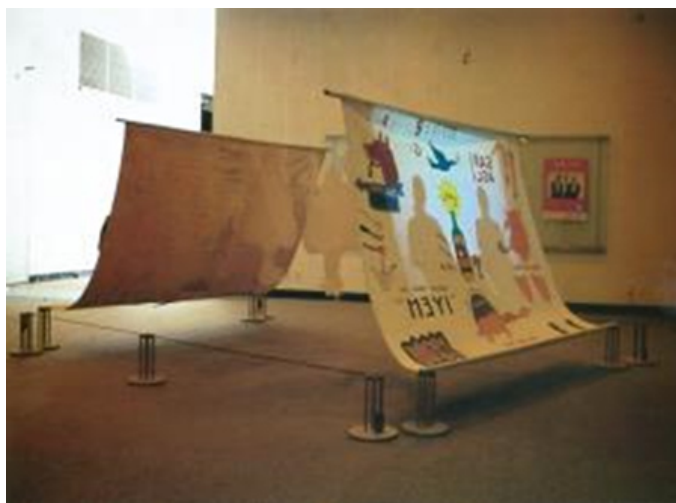
Figure 3. Heri Dono, “Hoping to Hear from You Soon” (1992)

usually appear on the fabric barrier to inform patrons of the menu. Heri Dono would host many of his guests, either from Indonesia or abroad, in warungs like these. The title of this work also hints at how the warung is often a witness to his parting with a foreign friend, perhaps to meet again someday.