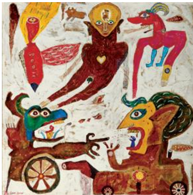
Figure 5. Heri Dono, "Life in the Wayang Land III" (1990)

Dono, the eye can be placed freely anywhere on the face, and the number of eyes is also free; it could be one, two or six. Meanwhile the mouth is often drawn complete with teeth, considered to be indexical of childishness and verbal aggression. A protruding tongue appears often also, indicating the intensification of verbal concentration on a primitive level. This also seems to be connected to the expression from the Javanese aphorism ' Ajining diri ono ing lathi ', which translates approximately to 'a person's value is in their expression and their words'. This saying is intended to encourage people to guard their every word and always speak correctly.