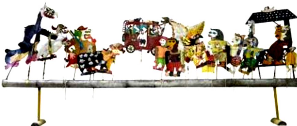
Figure 2. Heri Dono, "Wayang Legenda" (1988)

Heri Dono's work "Wayang Legenda" took up the Batak folk tale. The work is comprised of 60 figures that were exhibited in Jakarta (June 1988) and Seni Sono Art Gallery, Yogyakarta (September 1988). The aesthetic influence of Picasso is palpable in the wayang characters in this work. In the process of making "Wayang Legend" a number of artists who are friends of Heri Dono were involved. It is neither a painting nor a sculpture. However, it is not really designed as an installation piece because it is meant to be a setting for shadow puppet shows, complete with a screen and the banana trunk used to arrange the puppets. Heri Dono's expressions are reflected in the two rows of puppets presented in that work. None of those puppets (made from cardboard instead of the traditional leather) is similar to the puppets from Javanese classical tradition. All of Heri Dono's caricatural puppets carry messages that appear through symbols. During a performance, these symbols would act as a way to convey cynicisms that rose out of the narration about nonsensical or illogical reality.