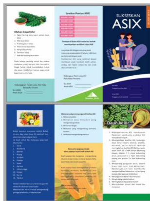
Fig.6. Serial leaflet 6

Figure 5. The fifth series in this leaflet is titled breastfeeding to breastfeeding X, the purpose of this 6th leaflet is to provide information so that mothers can continue to give breastfeeding for at least 6 months. In this series tips on multiplying breastfeeding, smoothing breastfeeding and additional information about the benefits of breastfeeding are conveyed in detail.