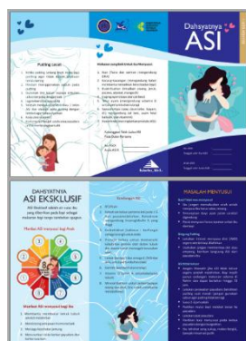
Fig.1. Serial leaflet 1

From the problems found in the diagnosis stage, researchers have formulated the problem of the need for increased knowledge both of the baby's mother and the Maternal and Child Health Services cadre. Efforts to increase knowledge have been created serial leaflets about exclusive breastfeeding. In the second stage, researchers have created a 6 series leaflet, which provides information on how to achieve exclusive breastfeeding in each month.