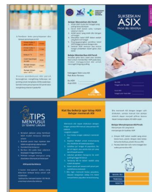
Fig.4. Serial leaflet 4

Figure 3. Series 3 leaflet with the title smooth out breastfeeding X, breastfeeding X is a term that is made with the meaning of "Exclusive" breastfeeding-X or A-SIX which is breastfeeding "6 months". This series provides information about ways to facilitate breastfeeding and the benefits of breastfeeding in contraception.