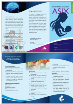
Fig. 5. Serial leaflet 5

Figure 4. The fourth series of this leaflet is titled breastfeeding X success in working mothers. Considering the baby's age of four months is a period in which the working mother has finished passing her maternity leave rations. In this series, some information is provided for working mothers to be able to provide exclusive breastfeeding. The information provided includes how to express milk, store breastfeeding, dilute milk and give milk to babies.