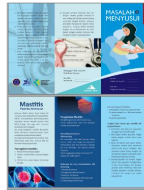
Fig.2. Serial leaflet 2

Figure 1. Series 1 leaflet with the title of the enormity of the breastfeeding series. This leaflet series 1 provides information about the benefits of exclusive breastfeeding for babies and mothers, the content of breastfeeding, problems that are often experienced in nursing mothers in the first month and its handling, and good food for nursing mothers.