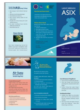
Fig.3. Serial leaflet 3

Figure 2. Series 2 leaflet with the title breastfeeding problems in the second month and how to overcome them.