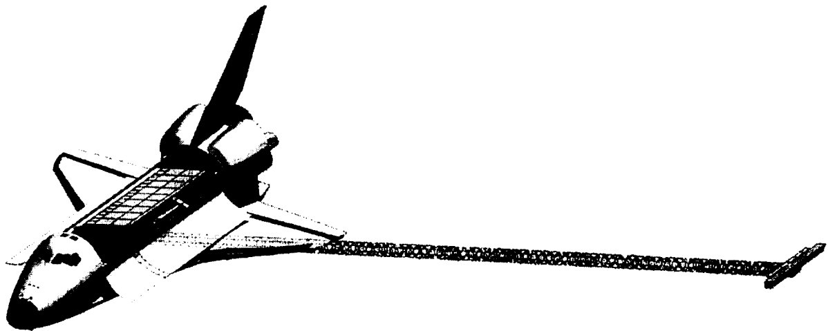
Figure 1. The SRTM payload in the Space Shuttle. The main antenna is seen in the payload bay and the outboard antennas are at the end of a 60 m mast.

The Shuttle Radar Topography Mission (SRTM) (Fig. 1), is a cooperative project between NASA and the National Imagery and Mapping Agency (NIMA) of the U.S. Department of Defense. The mission is designed to use a single-pass radar interferometer to produce a digital elevation model of the Earth's land surface between about 60 degrees north and south latitude. The DEM will have 30 m pixel spacing and about 15 m vertical errors.