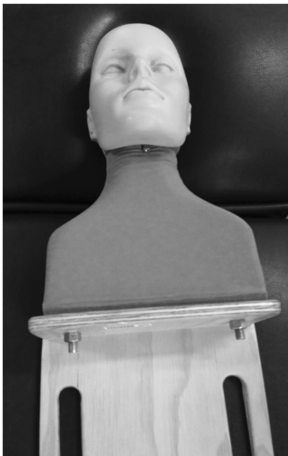
Fig. 1 The mannequin

three, two hour weekly training sessions in the performance of a commonly used cervical spine manipulation technique referred to as the index pillar push [21]. During the weekly training sessions and to ensure that the assessor remained blinded to group allocation students were supervised by academics not involved in the assessment of the students. The supervising academics provided each student with regular personalised feedback relating to their performance of the required technique during the weekly training sessions. After the third weekly training session, all members of each group crossed over and undertook three additional training sessions using the alternate method. The flow of the study is displayed in Fig. 3.