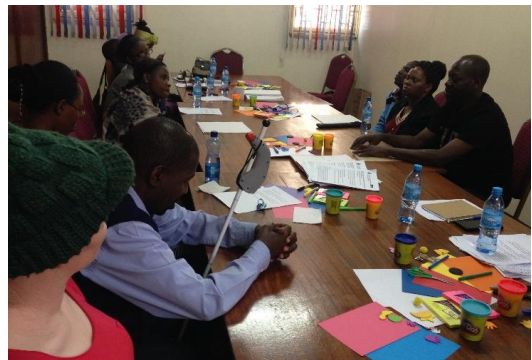
Figure 2. The community mobilizer reads aloud the braille version of the narrative for one of the storytelling exercises during the co-design workshop

In the storytelling activity, participants were divided into groups of three people. The community mobilizer read the narrative out loud (see Figure 2). The groups were then asked to complete their own fictional stories. Each group had a facilitator from the research team whose role was to support and involve the entire group. At the end of the exercise a volunteer from each group read out their story to all the other participants. In the modelling activity the groups were asked to produce designs for technology that could support independent lives and present to the rest of the group a scenario in which the technology would be used in the future. Each activity was followed by a facilitated group discussion about the stories and designs that had been produced.