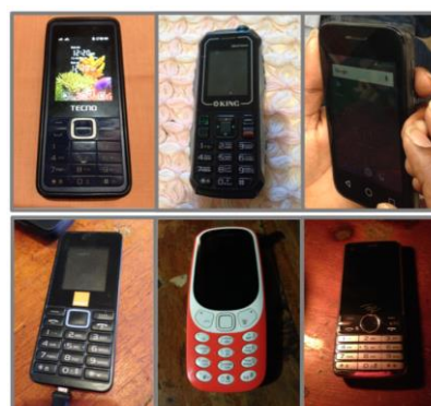
Figure 1: Mobile phones used by interviewed participants

During ethnographic observations, participants demonstrated how they used their mobile phone inside and outside of their home for everyday purposes related to their personal and working lives. Attention was also paid to the use of other technologies and any interaction that occurred with relevant members of the human infrastructure of the participants. Short unstructured interviews were carried out with these technology supporters to further explore the different interactions. Informed consent for these unstructured interviews was gathered verbally before data was recorded.