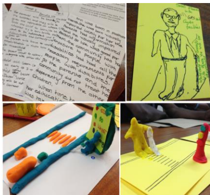
Figure 3: Stories and technology solutions developed by participants during the co-design workshop. From top left clockwise: Stories from the future, GPS-enabled talking white cane and two Barra Barras (Zebra crossings).

The society described provided VIPs with the support they needed to thrive, and the children of the future became world-renowned doctors, computer engineers and pilots because they had both advanced technology and supportive social systems. The mobile phone was not explicitly mentioned as part of this future. Instead participants designed an array of connected technologies (see Figure 3). Interestingly, nearly all of these technologies exist, and nearly all solutions focused on navigation. Independent navigation is key to developing social interactions within people’s lived environments [46]. The importance of navigation was clearly evident in study 2, which makes its complete omission in study 1 all the more poignant (it was identified by its omission as a restricted interactions).