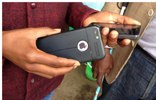
Figure 4: An example dependent interaction - an M-Pesa agent helps a participant perform financial transactions by entering relevant data on the phone.

All participants had built relationships with one specific M-Pesa agent that they would go to in order to complete essential mobile banking transactions. The agents of these trusted shops are relied upon. Often the VIP would assess how they were treated, then build up trust by becoming a committed and loyal a customer. VIPs had honed their abilities to assess which people were trustworthy through trial and error. This trust was built up "little by little until the time that my instinct tells me that you are a good person" [P06, Interview]. Most participants were very cautious about deciding which shopkeeper they would trust, and this was often motivated by the fact that they had been defrauded or they have had items stolen from them before.