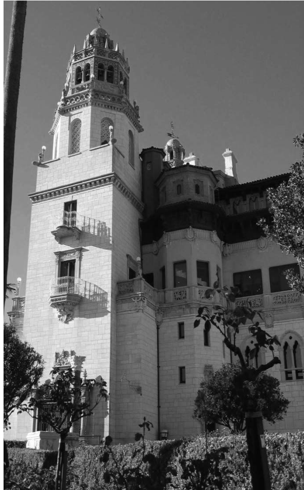
Fig. 4: Casa Grande, San Simeon, California, ca. 1925.

With these goals in mind, Huntington purchased (in 1902) one of Spain’s finest private libraries -that of the Marqués de Jérez de los Caballeros- and shipped it to New York, where it later became the nucleus of the Hispanic Society’s library. In addition to books and manuscripts, the Hispanic Society housed paintings, ceramics, sculpture and other objects d’art that Huntington and his agents purchased in Europe with an eye towards creating a collection meant to demonstrate what he once referred to as “the soul of Spain” 21 . Opened to the public in 1908, the Hispanic Society attracted vast crowds to its Neo-Classical building in uptown New York, and the crowds returned in the following years for exhibitions of paintings by Sorolla and Zuloaga, the first of Spain’s “modern” artists to acquire a large following in the United States. The success of