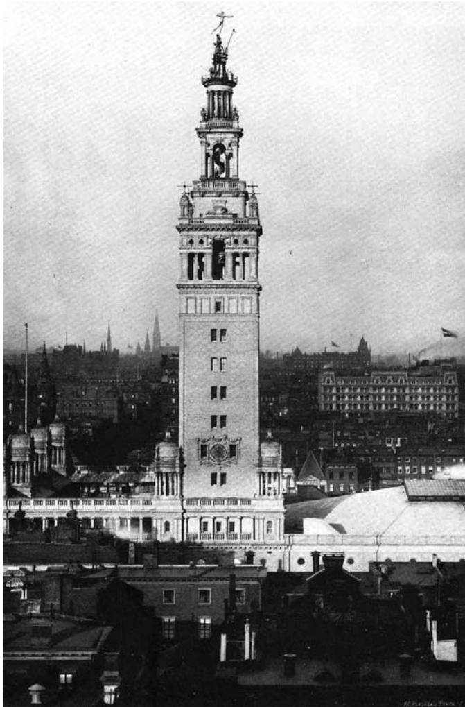
Fig. 1: Madison Square Garden, New York, NY, 1890.

Designed by the famed New York architect, Stanford White, this "Giralda" was the first of many other replicas of Seville's famous monument that were erected in the United States between 1890 and 1930 (*).