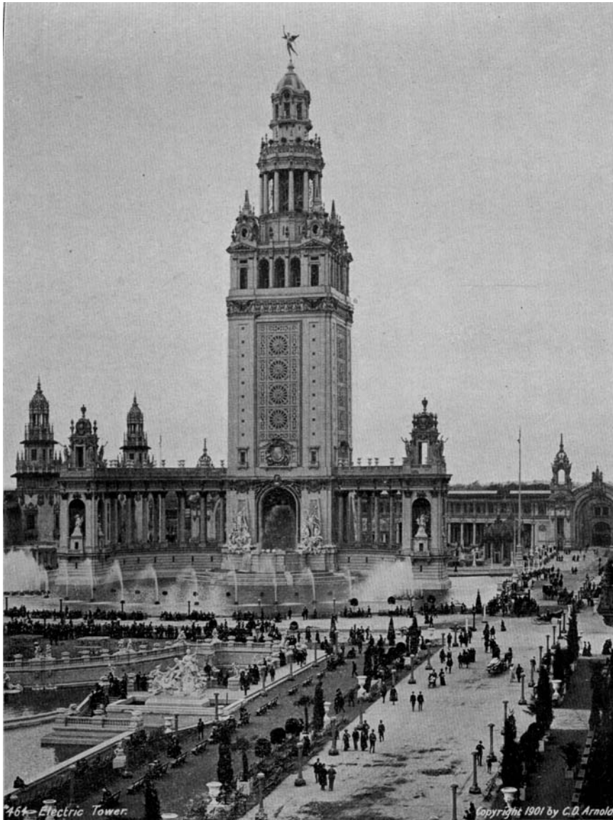
Fig. 2: Electric Tower, Pan-American Exposition, Buffalo, New York, 1901. Brilliantly illuminated by thousands of electric bulbs, this tower represents another example of United States interest in what was described as “Spanish Renaissance” architecture.

Architecture alone, however, was not enough to contain America's growing enthusiasm for Spanish culture and art. In 1890, the same year in which Manhattan