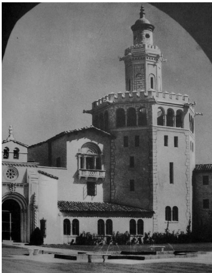
Fig. 3: Hotel Royalat, St Petersburg, Florida, 1925. Modeled after the Torre de Oro in Seville, this building exemplified on-going United States in Spanish architecture of the Middle Ages and the Renaissance.

Such remarks, inspired in large measure by the anti-Spanish prejudice inherent in the Black Legend, began to change in the 1890s, as Royal Cortissoz, Charles Caffin and other New-York based art critics, echoing the ideas of Chase, detected a similarity between the freedom of expression and naturalistic style of Velázquez and