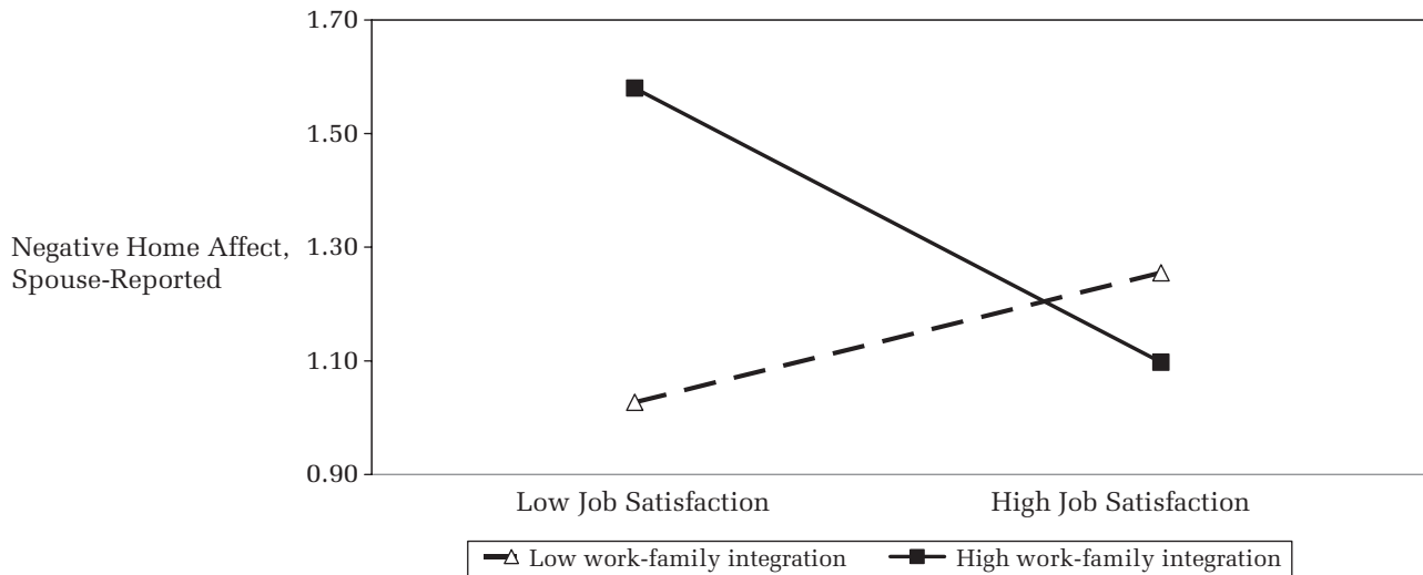
FIGURE 2 Interactive Effect of Work Family Integration and Job Satisfaction on Home Negative Affect a

a Low job satisfaction and low work-family integration represent scores one standard deviation below the grand means on their respective measures; scores are one standard deviation above grand means.