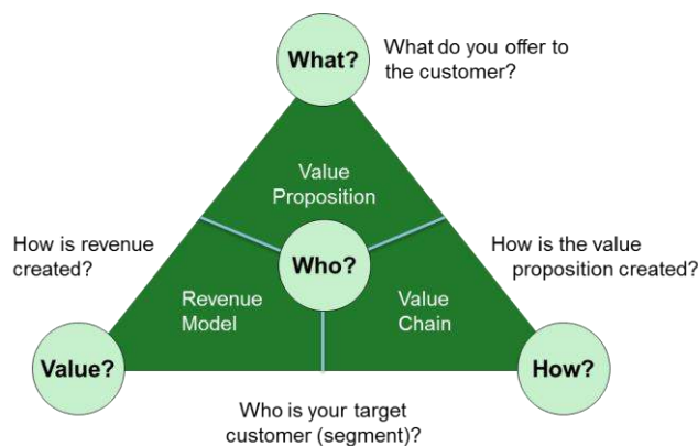
Fig. 1 Business model definition – the magic triangle

Value: The fourth dimension explains why the business model is financially viable, thus it relates to the revenue model. In essence, it unifies aspects such as, for example, the cost structure and the applied revenue mechanisms, and points to the elementary question of any firm, namely how to make money in the business (see Fig. 1).