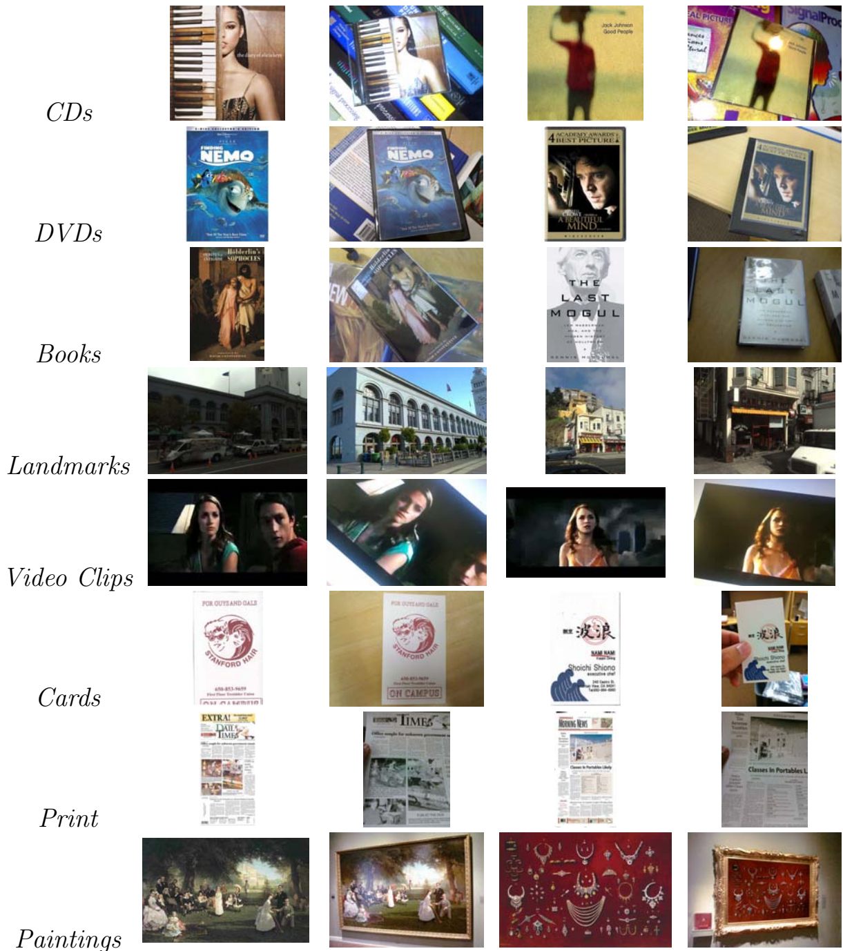
Figure 4: Stanford Mobile Visual Search (SMVS) data set. The data set consists of images for many different categories captured with a variety of camera-phones, and under widely varying lighting conditions. Database and query images alternate in each category.