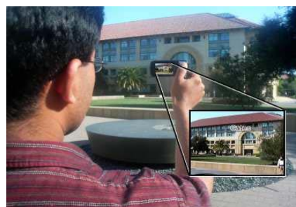
Figure 1: A snapshot of an outdoor visual search application. The system augments the viewfinder with information about the objects it recognizes in the camera phone image.

Mobile visual search applications pose a number of unique challenges. First, the system latency has to be low to support interactive queries, despite stringent bandwidth and