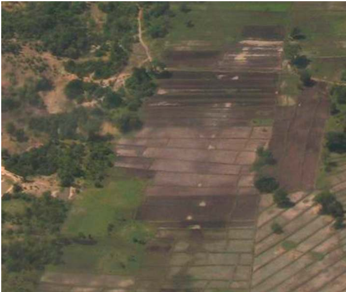
Figure 3. Aerial photograph of rice paddies after harvest in Tanzania. Difference in soil color in the middle of the fields is indicative of variation in soil nutrient availability within rice paddies, which is caused by the movement of biomass to the middle of the field during threshing.

Biomass removal is a common practice in smallholder systems where weeds and crop residues are uprooted from the farm field and tossed to the field edges. Relocation of this biomass translates to relocation of valuable nutrients and organic matter to the field edges and nutrient mining in the middle of the farm fields. In contrast, rice threshing often occurs in the middle of the drained paddy, which concentrates nutrients (mainly K) in the center of the field (Figure 3).