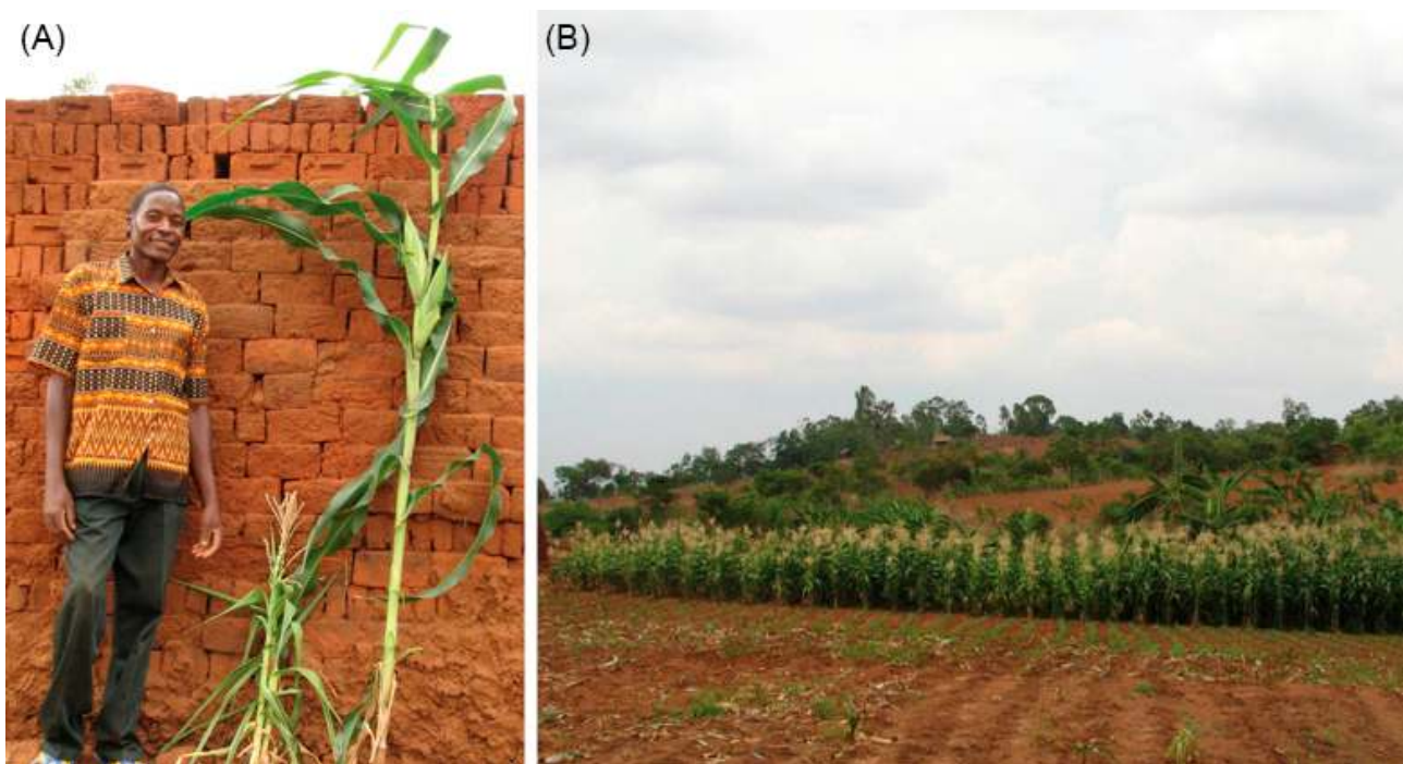
Figure 2. (A) Difference in size maize plants in (B) a field experiencing soil degradation due to erosion near Mwandama, Malawi. Reduced stature of maize (B) appears to be a matter of perspective however, when plants from each end of the field are compared side-by-side (A), it is clear that small slope can have dramatic effects on crop productivity due to the movement of water, soil, and nutrients.

Visual assessment can provide much detail on the state and potential drivers of soil degradation. Root exposure in trees and shrubs are other indicators of soil erosion that can be quickly assessed. Crop productivity often declines as you move uphill (even on very gentle slopes) as soil moves downslope (Figure 2). Erosion “pins” can be deployed easily at the beginning of a cropping season to measure the amount of sheet erosion occurring within a given time period [116].