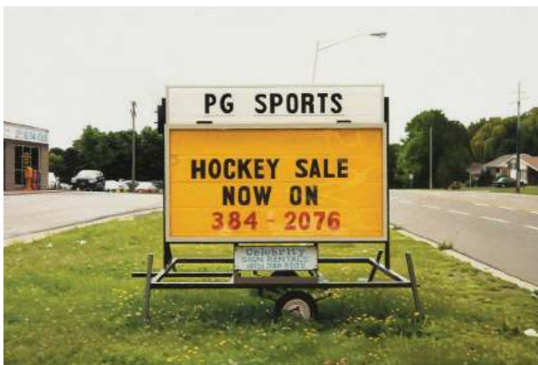
Figure 3. Hockey Sale, painting by M. Bayne (2010). Reproduced by permission of the artist.