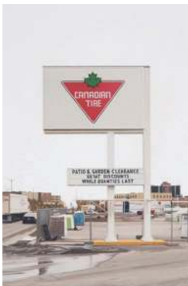
Figure 5. Patio & Garden , painting by M. Bayne (2015). Reproduced by permission of the artist.