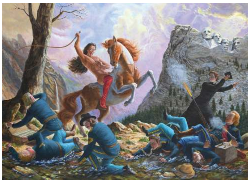
Figure 6. Expelling the Vices , painting by K. Monkman (2014). Reproduced by permission of the artist.

The intent of the framework introduced above is not to suggest a new catechism of the Canadian national narrative. Newly minted storylines of the past, although perhaps more persuasive, continue to be framed by the lens of the current historical moment and are problematic once fixed. Moreover, a framework of this sort could not possibly cover everything. For example, smaller scale narrative templates that address localities and are valuable for groups in the maintenance of identity and cultural survival are only partially addressed (Carr, 1986). Rather, it reflects the national narratives that are frequently constructed and communicated in sites of pedagogy, and points to the narrative organization of historical consciousness. How then can all of this be applied to history education?