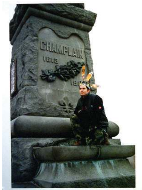
Figure 1. Onkwehonwe , photograph by J.M. Thomas (2001). Reprinted with permission of the Art Bank.

The controversy around Canada’s Champlain Monument and others like it that is erupting around the world (see, e.g., Renzetti, 2015) reveals the power and controversy inherent in sites of pedagogy—classrooms, textbooks, monuments, memorials, national historic sites, news media, architectural spaces, arbitrated cityscapes, and public performances—that construct and communicate national narratives (Carretero, 2011; Donald, 2009; Ellsworth, 2005; Nora, 1996). These national narratives are discursive devices that combine history, collective memory, and myth into teleological communications of a nation’s past, present, and future, what Hobsbawm (1990) has called “the nation’s programmatic mythology” (p. 6). Often, they attempt to suture a country’s differences by representing its citizens as belonging to a larger national famiglia , the imagined community of the nation-state (Anderson, 1996).