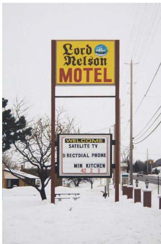
Figure 4. D-rectdial, painting by M. Bayne (2015). Reproduced by permission of the artist.