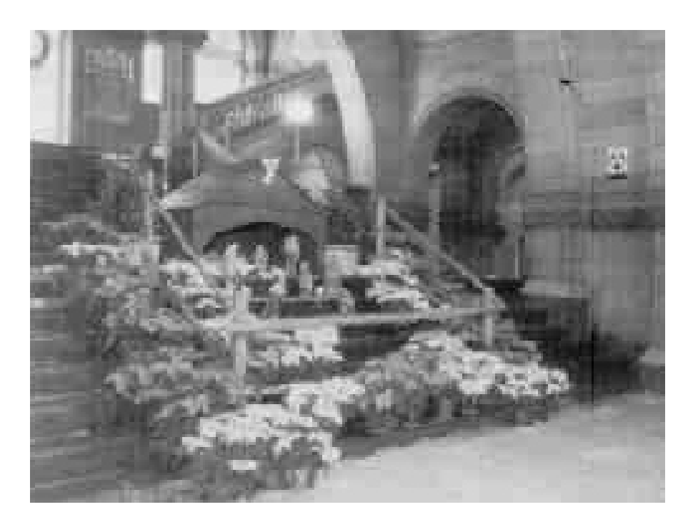
Figure 4.1. Crèche found to violate the Establishment Clause in Allegheny .