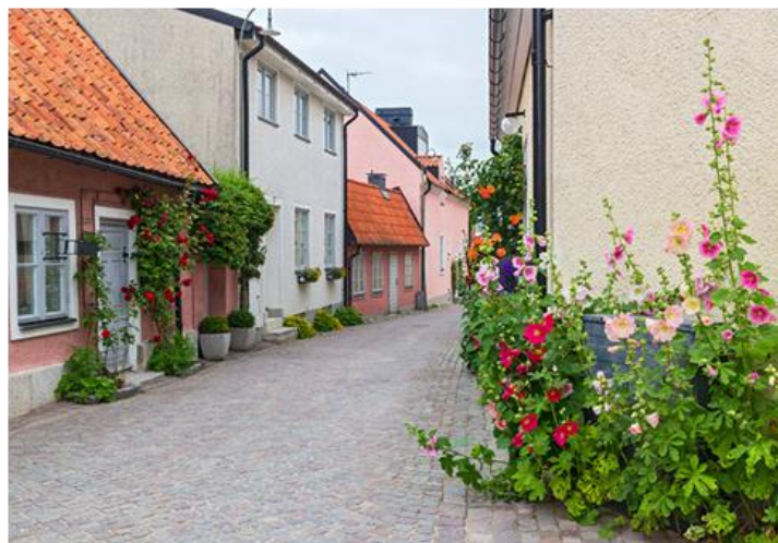
Figure 2. Visby Old City

three historical towns, Bethlehem, Beit Jala, and Beit Sahour. The three towns lie within the urban center that have upheld outstanding qualities of the historical urban fabric dating back to the Ottoman period and have maintained relative homogeneity in volumes, materials, as well as unique architectural typologies (CCHP: 2013).