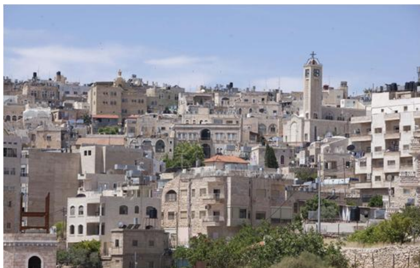
Figure 4. Bethlehem Old City

surrounded and provided a view of the cave where Jesus Christ was born. The church was partially destroyed in 529 AD during the Samaritan Revolt and was later overlaid by the present church on a much