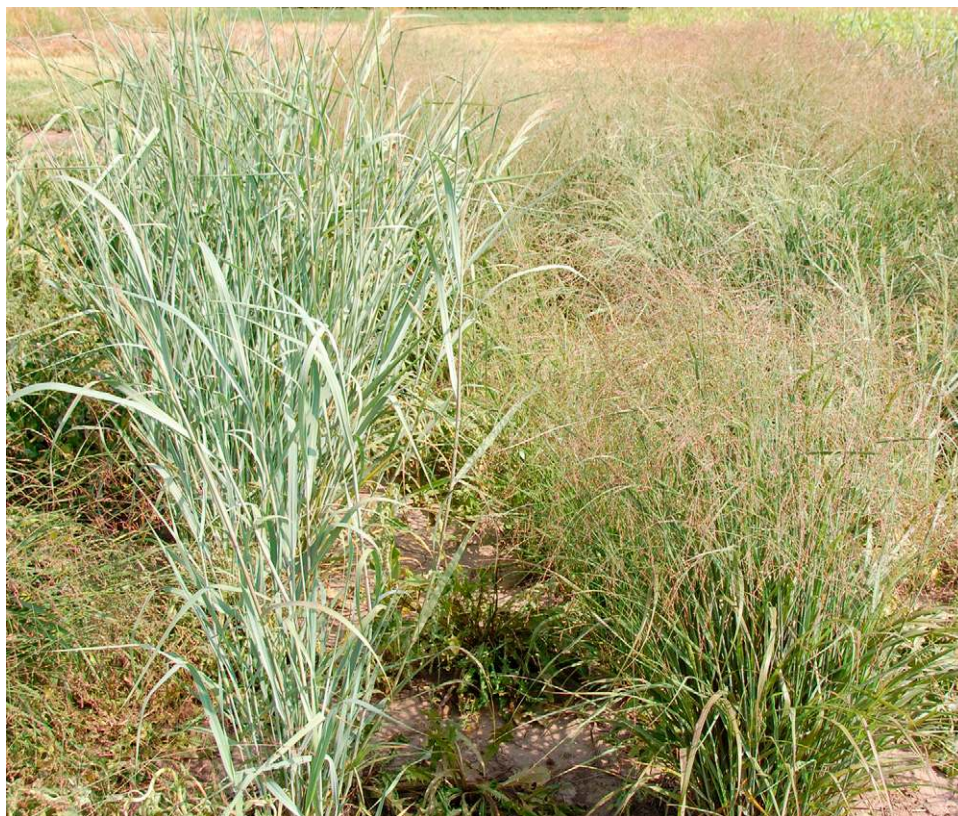
Figure 2. Photograph of lowland switchgrass (left) and upland switchgrass (right) taken in late August near Arlington, WI.

and cytogenetic studies especially for generation of inbred lines and to assist genome-sequencing effort but all individuals have so far been completely male and female sterile (Young et al., 2010; D.L. Price and M.D. Casler, personal communication, 2011).