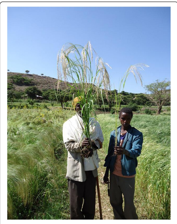
Figure 7 Comparison of transplanted STI plant on left, and broadcasted tef plant on right, same variety (Hailu Araya).

For countless generations, this crop has been grown by broadcasting with high plant densities. STI, in contrast,