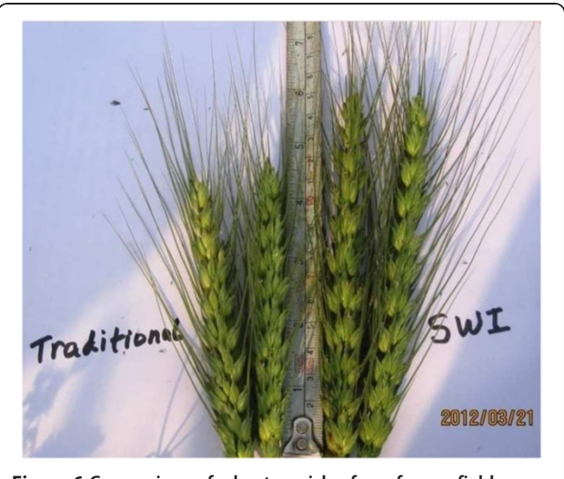
Figure 6 Comparison of wheat panicles from farmer field school trials in mid-Nepal (Devraj Adhikari).

In the 2011-12 season, farmer field school experiments conducted in Sindhuli district with similarly modified SWI practices also showed better yield and economic returns. Pre-germinated seed of Bhirkuti variety sown at 20 \times 20 cm spacing gave 54% more yield than the available best practices under similar conditions of irrigation and fertilization: 6.5 tonnes/ha from SWI methods compared to 3.7 tonnes/ha with conventional broadcasting, and 5 tonnes/ha with row sowing [36].