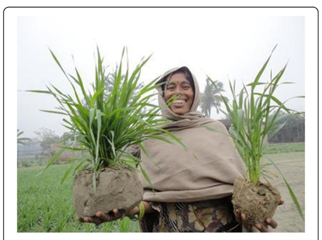
Figure 4 Farmer in Muzzafarpur district of Bihar state, India, showing difference between wheat plants, same variety, grown with different management practices. SWI methods, on left, promote root growth and soil organisms that contribute to more tillering, larger panicles, and more grain.

The Aga Khan Rural Support Programme in India has also been introducing SWI in Bihar state with different but still favorable results. It reported SWI yield increases less than other parts of India, just 32%, with farmers averaging 3.48 tonnes/ha instead of 2.63 tonnes/ha with usual practices. However, farmers' costs of production with this version of SWI declined by 2% per hectare rather than increasing. Accordingly, their cost per kg of grain produced was Rs 8.17 with this less intensified version of SWI compared to Rs 11.05 using standard practices. This SWI makes wheat cultivation more profitable, as standard practices produce little net income for farmers, just Rs 1,802 per ha. On the other hand, with