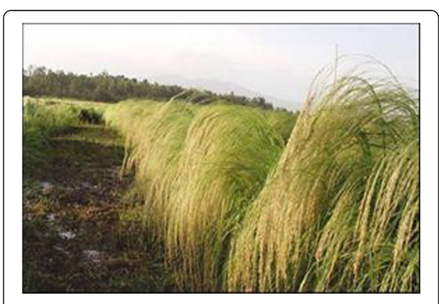
Figure 8 STI tef crop ready for harvest at Debre Zeit Research Station in Ethiopia (Tareke Berhe).

For a number of crops, Ethiopian farmers are now either transplanting young seedlings or sowing seeds directly in rows, with wide spacing between the rows and