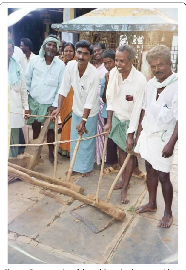
Figure 1 Demonstration of the yedekunte implement used by farmers in Karnataka state of India. The implement cuts weed roots below the soil surface between rows, thereby also aerating the top layer of soil (Norman Uphoff).

In northern India, the People's Science Institute (PSI) undertook the first trials of another version of SFMI in 2008. Forty-three farmers in the Himalayan state of Uttarakhand tried these methods on a small area of 0.8 ha. Their results showed a 60% increase in grain yield, moving from an average of 1.5 tonnes/ha to 2.4 tonnes/ha. By 2012, more than 1,000 farmers were using locally-adapted SFMI methods, spacing their plants 20 \times 20 cm apart and establishing them either by direct-seeding or by transplanting young seedlings just 15 to 20 days old.