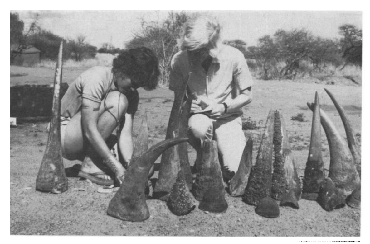
It is possible that some of these white rhino horns from Pilanesberg Game Reserve in Bophuthatswana could have ended up in Taiwan.

from an auction in Windhoek, Namibia, for US$ 460 per kg in 1983, which he sold to a businessman in Taipei for US$ 750 per kg. He also supplied rhino hide to the businessman for US$ 60 per kg. After mid-1985, neither South Africa nor Taiwan legally permitted this commerce, but the trade has flourished underground. Over the past few years, political and economic relations between the two countries have strengthened. The South African Government has actually been encouraging Taiwanese