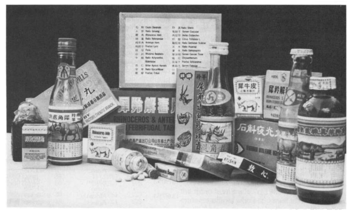
Rhino horn medicines such as these are smuggled from China into Taiwan by boat (Esmond Bradley Martin). The Taiwanese connection

In Taiwan itself, pharmacy shops are doing a brisk business in rhino horn as many of the 20,000,000 Taiwanese prefer rhino horn to any other traditional drug for lowering fever, and the average consumer can afford the increased prices. Despite the illegality of imports, 73 per cent of the larger medicine shops in Taipei and nearly 90 per cent of those in Kaohsiung openly