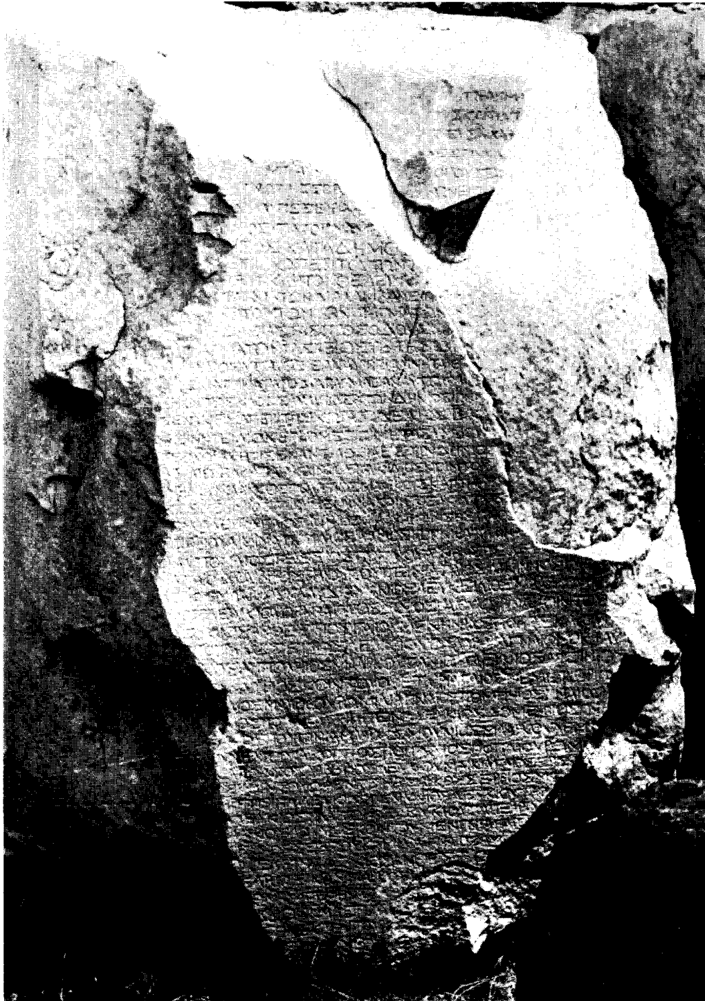
SMYRNA INSCRIPTION (COPY B) OF SENATUS CONSULTUM DE AGRO PERGAMENO THE STONE: FRAGMENTS A AND B