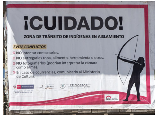
PLATE 1 A sign supplied by the Peruvian Ministry of Culture and posted on a riverfront building in Boca Manu warns residents to avoid conflicts with voluntarily isolated indigenous groups by not attempting contact, not providing goods or supplies, and not photographing them, and to report any encounters to the Ministry. Sightings are becoming increasingly frequent on river banks in the Manu region.

Coca production The cultivation of coca leaves, the source of cocaine, in Peru is second in volume only to Colombia and, although permitted in some quantity for traditional use, is mostly illegal (UNODC, 2015a,b). Cultivation is closely linked to road development in the western Amazon: during the 1960s–1970s, government-sponsored road projects and colonization schemes drew farmers to the region, many of whom later turned to coca as an alternative cash crop in the face of dwindling government support and falling prices for their legal commodities (Dávalos et al., 2016). Although currently in general decline nationwide, coca production in Madre de Dios has increased by > 52% in recent years; Cusco's Kosñipata district (of which Pillcopata is the capital) has also seen production increase, from 338 ha in 2010 to 1,322 ha in 2014. Much of this production is destined for Brazil, the world's second largest market for cocaine (UNODC, 2015b). The most direct route to Brazil from Madre de Dios is either across an expansive, mostly uncontrolled border with Bolivia to the east or directly into the Brazilian state of Acre, to the north; both of these are accessed easily by the newly paved Interoceanic Highway. The improved connection of coca-producing areas in Manu to the Interoceanic Highway via Boca Colorado (Fig. 1) could therefore have a dramatic impact on illicit coca production and cocaine trafficking in the region.