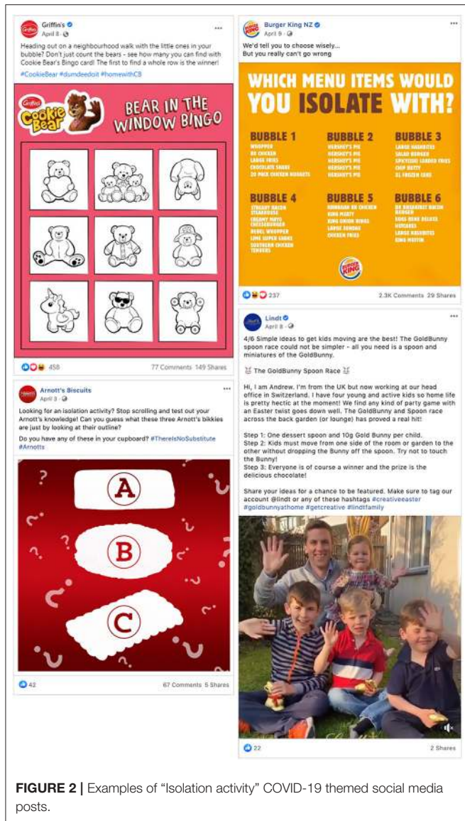
FIGURE 2 | Examples of “Isolation activity” COVID-19 themed social media posts.

the ASC Code by encouraging excessive consumption in the general population. Because of the vague language of the Principle in the ASC that states “Advertisements must be prepared and placed with a due sense of social responsibility to consumers and to society,” and “Advertisements must not undermine the health and well-being of individuals” it is arguable that all unhealthy food and beverage brands promoting consumption of their products with COVID-washing techniques were undermining the ASC.