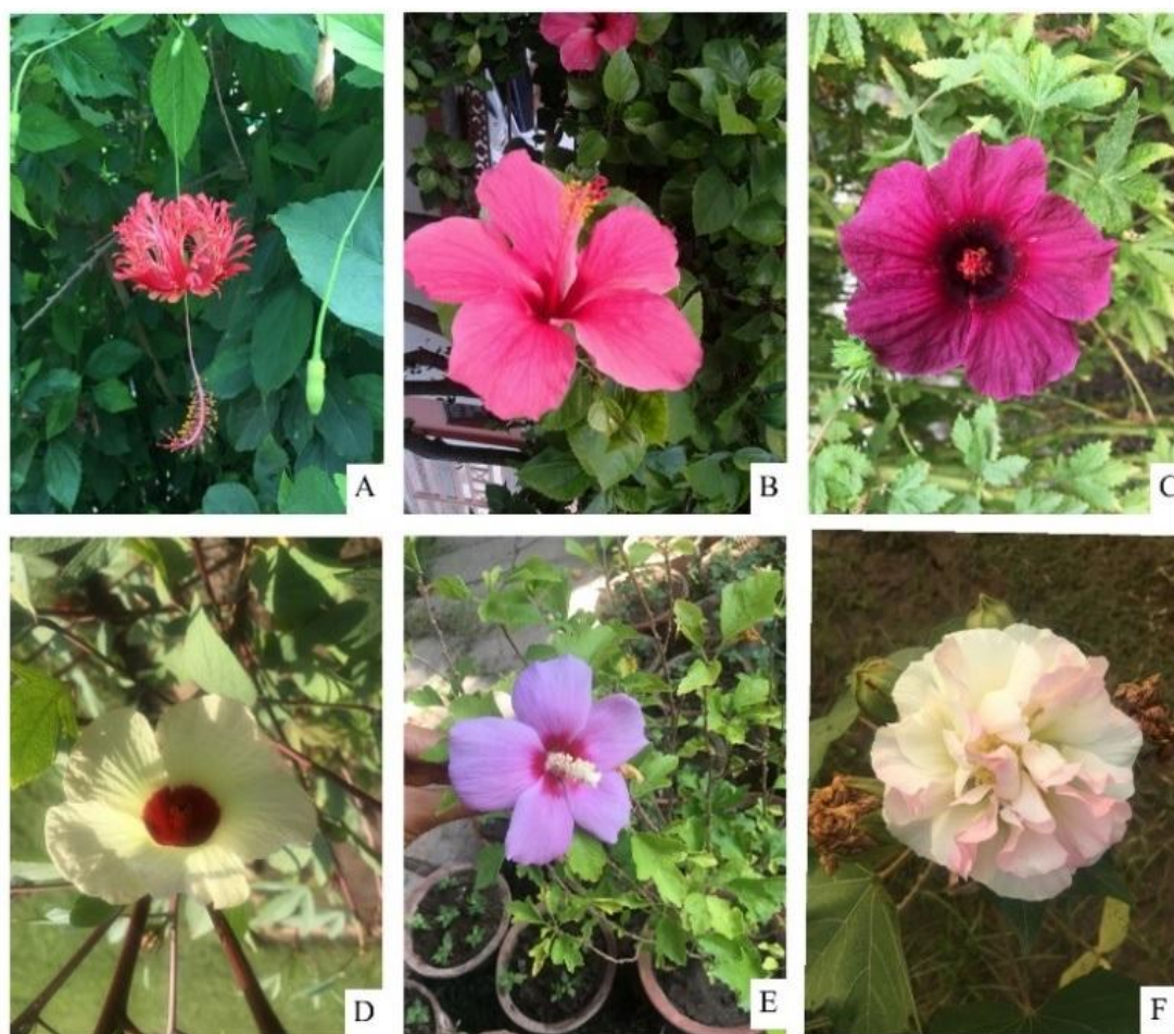
Fig. 1. A) Hibiscus schizopetalus ; B) H. rosa-sinensis ; C) H. radiates ; D) H. sabdariffa ; E) H. syriacus ; F) H. mutabilis