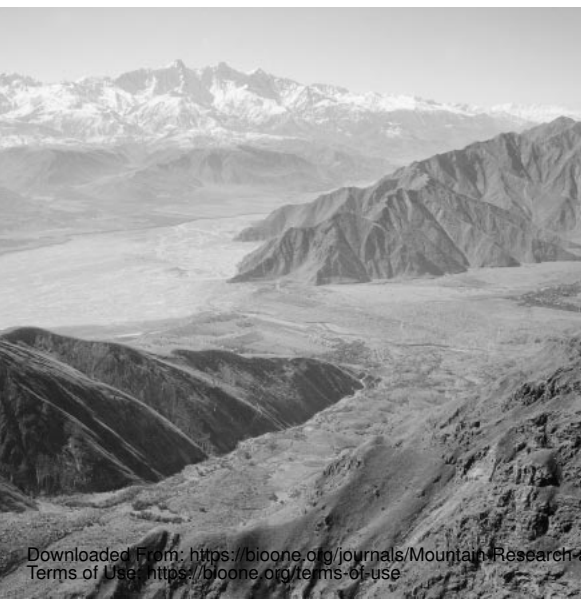
FIGURE 2 Aerial view of the lower Surkhob Valley in the Tajikistan Pamir. The valley floor, from the bottom left almost as far as the main river, is buried under the rock debris that resulted from a massive rockfall and landslide triggered by the major earthquake of 1949. The rock debris covers the former site of Khait, the regional administrative center.

occurrence of large landslides, for instance, that blocked valleys and dammed up ephemeral lakes. Subsequently, some of these lakes must have drained catastrophically. One of the more recent of the landslide lakes is Lake Sarez. It originated following an earthquake that occurred during the winter of 1911 and today is more than 60 km in length and over 500 m deep (Alford et al 2000).