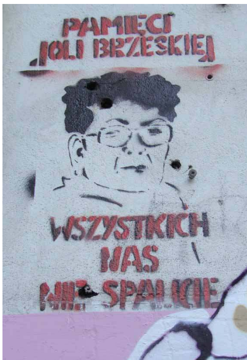
Figure 6 Jolanta Brzeska as a mural on one of Warsaw's squats with the text 'To the memory of Jola Brzeska, You will not burn us all'

positions vis-à-vis local authorities. As put by one of the squatters: