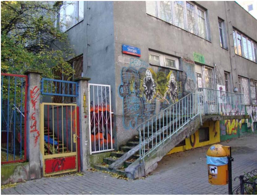
Figure 5 Przychodnia squat in Warsaw

‘Warsaw Tenants’ Association owes the squatters for these talks. It is true, because when the squat on Elblaska, Elba, was totally unrightfully terminated there was a manifestation in Warsaw. It was quite big and I think that the authorities are afraid of exactly that. And I think that there was none like that before. Indeed it was quite numerous and I even saw some social workers joining it. On this big square with good location. To do a demonstration over there that would be visible is quite hard, but a lot of people came actually. I think this was the reason why Warsaw authorities decided to have these talks. Because squatters gave a postulate on this round table and it is why it is taking place, it is why it exists, you know.’ (1)