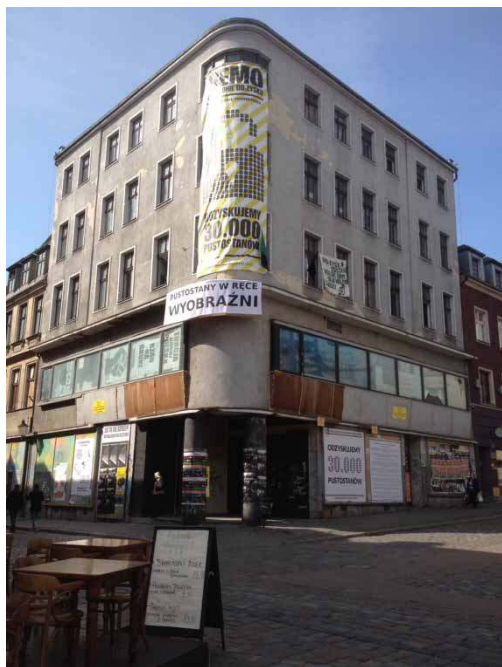
Figure 2 Squat Od:zysk in Poznań with banners stating ‘We are taking back 30,000 vacant buildings’ and ‘Vacant buildings in the hands of imagination’

squatting and connected initiatives are highly politicized and ideologized in Poznań, with a heavy influence of anarchism.