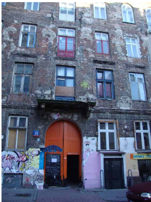
Figure 4 Syrena squat in Warsaw

Squatters and tenants initiated the Tenants' Round Table in 2012 following the eviction of a squat (Elba) in the city in March 2012 that was perceived by the activists as a threat and a pursuit of the authorities to extinguish the alternative scene in the city. Two factors put pressure on the local authorities to start a dialogue with squatters: the first was the gathering of a large number of supporters (2000 participants, quite a remarkable number for this kind of protest) at the demonstration following the closing down of Elba squat, and the second, the squatting of a municipal building (Przychodnia) (Figure 5), shortly after the closing down of Elba. For the first time since the first squat was opened in the city, local authorities were willing to start a dialogue/negotiation with squatters. The squatters' strategy, at the point of time when they perceived their position as favorable (an opportunity), was to form a formal alliance with tenants' organizations and represent both squatters and tenants' interests at the meetings with city authorities. Their claims covered specific