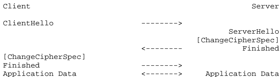
Fig. 2. Message flow for an abbreviated handshake

If a match is found, and the server is willing to re-establish the connection under the specified session state, it will send a ServerHello with the same Session ID value. At this point, both client and server MUST send change cipher spec messages and proceed directly to finished messages. Once the re-establishment is complete, the client and server MAY begin to exchange application layer data. (See flow chart below.) If a Session ID match is not found, the server generates a new session ID and the TLS client and server perform a full handshake.