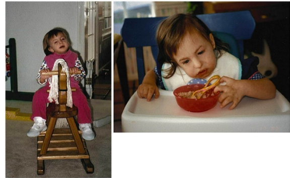
Figure 3 This girl, now 16 years of age and very healthy, had a ventricular septal defect repair as an infant; she is shown here at various ages enjoying a favorite pastime and feeding herself. She is walking with assistance but can climb stairs on her own.

As mentioned above (see "Etiology and Pathogenesis") among patients with mosaic trisomy 18 the phenotype is extremely variable, and there is no correlation between the percentage of trisomy 18 cells in either blood cells or skin fibroblasts and the severity of intellectual disabilities [24].