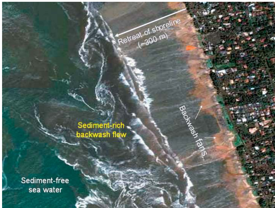
FIG 2.—An aerial image showing sediment-rich backwash flows during the 2004 Indian Ocean tsunami. Note that position of shoreline has retreated seaward nearly 300 meters (arrow) during the tsunami. Also note the development of backwash fans along the position of former shoreline, Kalutara Beach (south of Colombo), southwestern Sri Lanka. Image collected on 26 December 2004.

epicenter) is unrelated to the ultimate site of deep-water deposition (Fig. 1B). In the case of the 2004 Indian Ocean tsunami, for example, the site of tsunami origin was located in northern Sumatra, whereas the possible site of deep-water deposition would be on the continental slopes of the east coast of southern India. The tectonic setting of the east coast of India is analogous to the modern passive-margin setting of the U.S. Atlantic margin, with submarine canyons and gullies. Submarine canyons and feeder channels, common on the east coast of India (Bastia 2004, his fig. 7A), are potential conduits for transporting sediment by tsunami-triggered sediment flows into the deep sea. This stage involves neither sediment transport nor deposition.