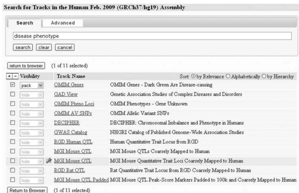
Figure 1. A simple search has been performed to find annotation tracks related to disease phenotype. One of the search results is a container of related tracks.

configure, and to make the browsing experience more intuitive.