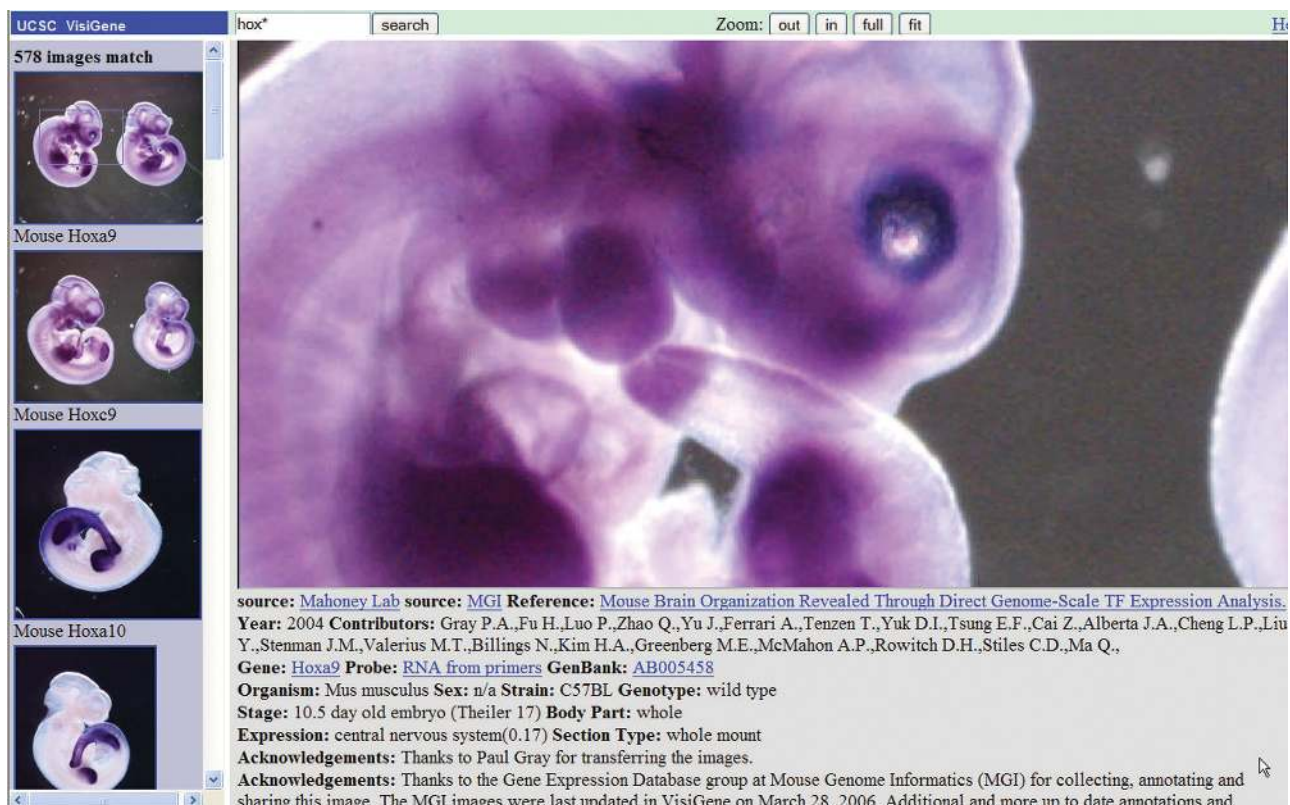
Figure 1. Screenshot of VisiGene display for mouse Hoxa9 gene.

VisiGene provides a series of thumbnail images in a panel to the left of the main viewing area and fully annotated full-resolution images in the main viewer area to the right (Figure 1). These are high-resolution images viewable in a