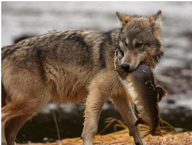
A coastal wolf is hunting salmon in British Columbia, Canada.

Are humans unsustainable 'super predators'?