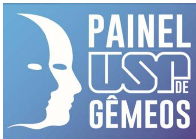
Fig. 1. Logo of the PaineL USP de Gêmeos.

The PaineL USP de Gêmeos takes precautions to ensure the rights of the enrolled twins. We use an online tool integrated with our website for twins' registration. Information is sent encrypted across the internet and is stored in a worksheet that can only be accessed through an account login.