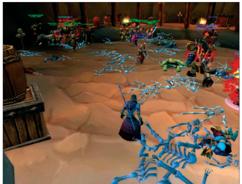
Figure 1: Urban centre in World of Warcraft during the epidemic

For more information on World of Warcraft see http://worldofwarcraft.com See Online for webfigure