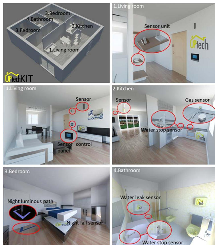
Figure 2 The design of the UP-TECH kit.

The creation of an information package for the 150 family caregivers included in the control group, illustrating the range of social and health services available in the local community, is planned. The information package will be delivered to the caregiver during home visits by the nurse. These caregivers and their families will continue to receive services in accordance with the usual care procedure, which, as already mentioned, does not include any other specific service from the health and social care systems. Some patients might receive additional care services, but