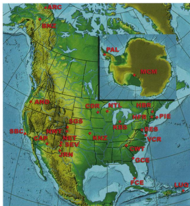
Figure 1. Map of location of LTER sites, courtesy of LTER Network office.

Soon the studies at Hubbard Brook expanded beyond chemical budgets to include questions about the species and biomass of the vegetation—that is, the structure of the forest—and about ecosystem functions such as the processes of nitrogen cycling and plant growth. As new questions came to the fore, measures were added such as changes in bird abundance and tree size, the rates of water and material movement in soils, and the rate of formation of dissolved organic carbon as water moves through the litter layers. The result was the formation of an intensive study site, that is, a location where a wide variety of information was assembled on