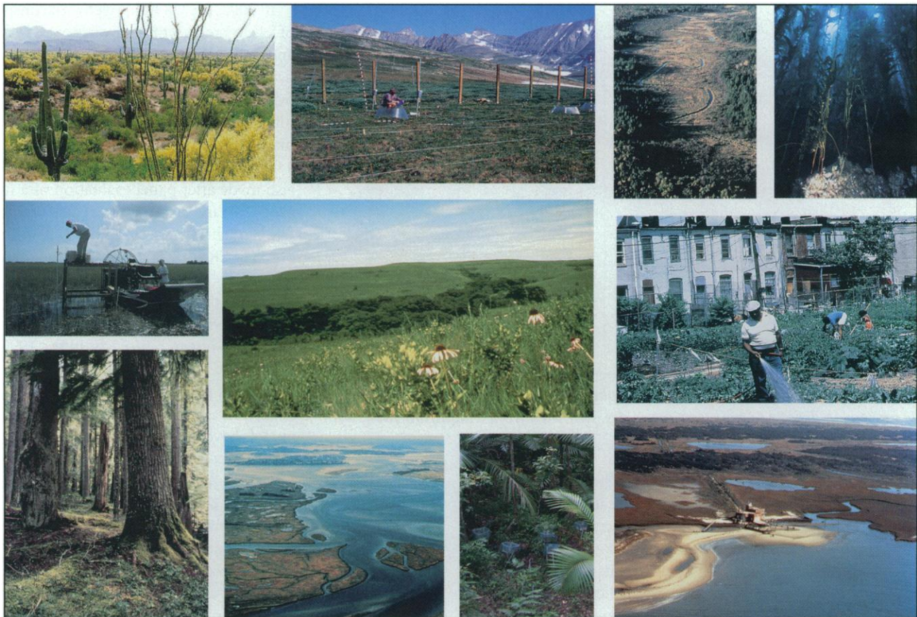
Figure 4. Various LTER habitats. From the upper left, the photographs on the outer border depict the following LTER site habitats: desert (CAP), alpine tundra (NWT), tall-grass prairie/oak woodland (CDR), kelp forest (SBC), urban (BES), salt marshes and barrier beach (VCR), tropical forest (LUQ), estuary (PIE), old-growth forest (AND), and everglades (FCE). The middle picture shows prairie (KNZ) habitat. Site codes are given in Table 1.

and sediments; (4) patterns of inorganic inputs and movements of nutrients through soils, groundwater, and surface waters; and (5) patterns and frequency of disturbances. There is no doubt that site-based research remains the most basic and essential element of the LTER program, because the long-term nature of its core studies provides a context for understanding interannual variability, disturbance effects, and gradual or rapid change (natural or human-induced).