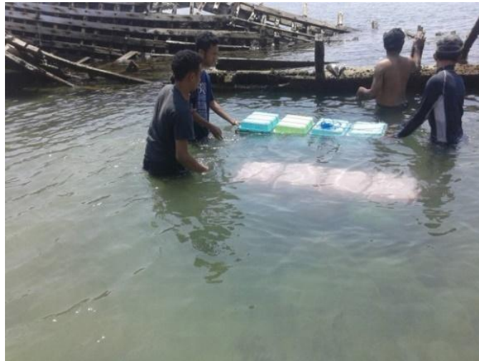
Figure 3. Positioning the containers with abalone larvae.