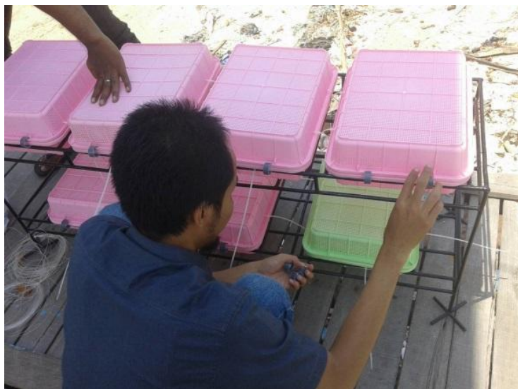
Figure 1. Abalone Rearing Containers.

A container with Abalone Juvenile larvae stocking density of 30 pcs/container (Figure 2).