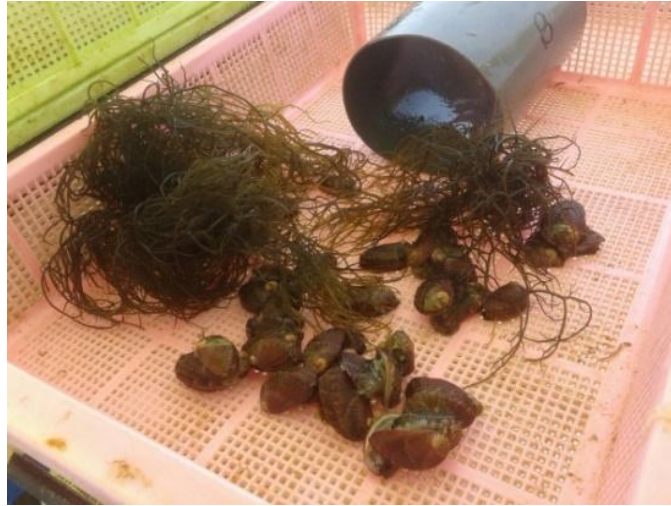
Figure 2. Abalone larvae were stocked in the container.