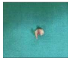
Fig. 1. Auricular cartilage [1]

graft is preferred if there is enough tissue to be harvested, because it shares the same location with the initial/nasal surgical field and due to its resemblance with the adjacent nasal cartilages [2].