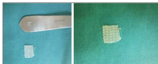
Fig. 4. Collagen-coated polypropylene mesh

today. The cellular coverage of the mesh may influence the biocompatibility and may become a key aspect in refining their properties, figure 4 [39]. The meshes can also be coated with human dermal fibroblasts (HFs) or with normal rats' kidney (NRK) cells or with rat's mesenchymal stem cells (MSCs). These coated meshes, either synthetic or biologic, modulate the host immune response and therefore enhance their adaptability [40]