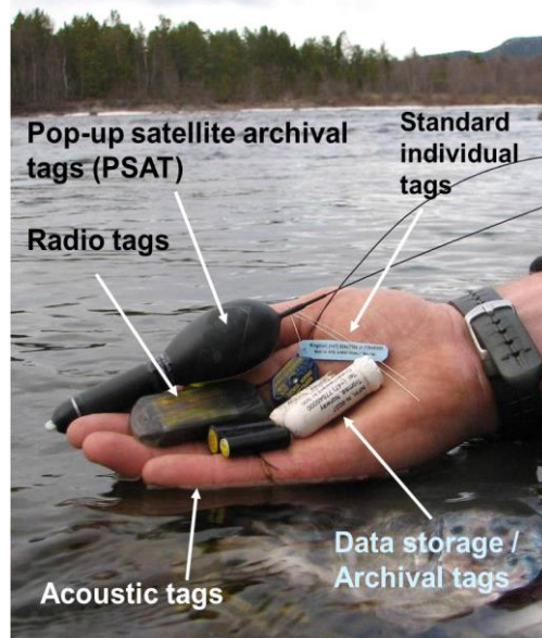
Figure 1. Examples of main types of active electronic tags. The standard individual tags may be used for external recognition and information to fishers to increase the return rate of internal electronic tags from recaptured fish.