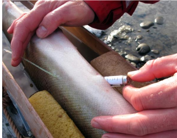
Figure 5. Internal tagging where an archival tag is inserted into the body cavity, with an external light and temperature sensor trailing through the body wall. A similar tagging method may be used for implantation of radio tags with an external antenna trailing through the body wall. After insertion, the wound was closed with two suture stitches.