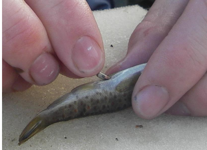
Figure 4. Tagging with a passive integrated transponder tag (PIT-tag). This tag is commonly inserted in the body cavity by use of a syringe implanter, or by cutting a small hole in the body wall with a scalpel and inserting the tag like in the picture.

receives the unique code back from the tag. PIT-tags are usually encapsulated in glass. The estimated lifetime of tags is several decades. The advantages with these tags are their small size (fish down to about 5 cm in body length can be tagged), the large number of unique codes and the long lifetime of tags. The disadvantage is the short detection distance of the readers (<1 m). PIT-tags are frequently used in tagging and recapture studies (Hedger et al. , 2013), and the tag ID can be identified using a hand held reader (Burnett et al. , 2013). Automatic stations with tubular or square shaped antennas, or flat-bed antennas, can be installed at suitable sites in small rivers and in fish passes to detect PIT-tagged fish passing the station (Lucas et al. , 1999; Aarestrup et al. , 2003). Portable readers can also be used to search for tagged fish in shallow areas of ponds and small rivers, but the efficiency is restricted by the short range. Signals can be detected through water and air. Detection range is dependent on tag size, operation frequency, antenna power, tag orientation and interference from other devices (Lucas and Baras, 2000). Detection range is reduced in saline waters, but stationary PIT-tag systems have also been used in marine environments (Meynecke et al. , 2008).