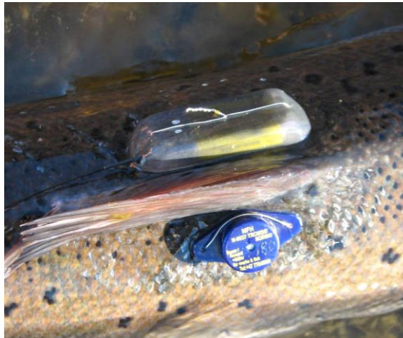
Figure 6. External attachment with a radio transmitter on one side and a data storage tag (DST) on the other side of the dorsal fin. Such double tagging is only suitable for large fish.