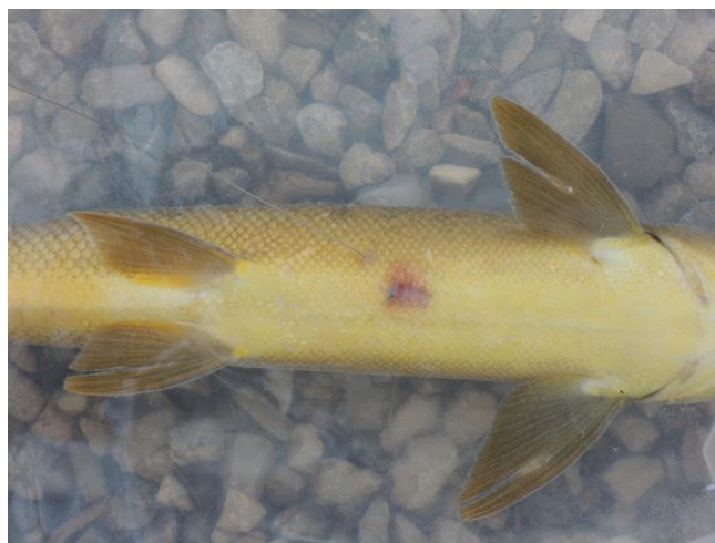
Figure 7. Healing of surgical incision of a Capoeta angoare with an implanted radio transmitter with a trailing antenna. The fish was recaptured in Ceyhan River in Turkey 20 days after tagging. Two sutures had already been shed, whereas the last suture was during the shedding process, which caused the irritated area around the incision. Once all sutures are shed, the sign of irritation usually disappears, and after some time it can be difficult to see where such incisions have been made.

The tag should have minimal effects on the