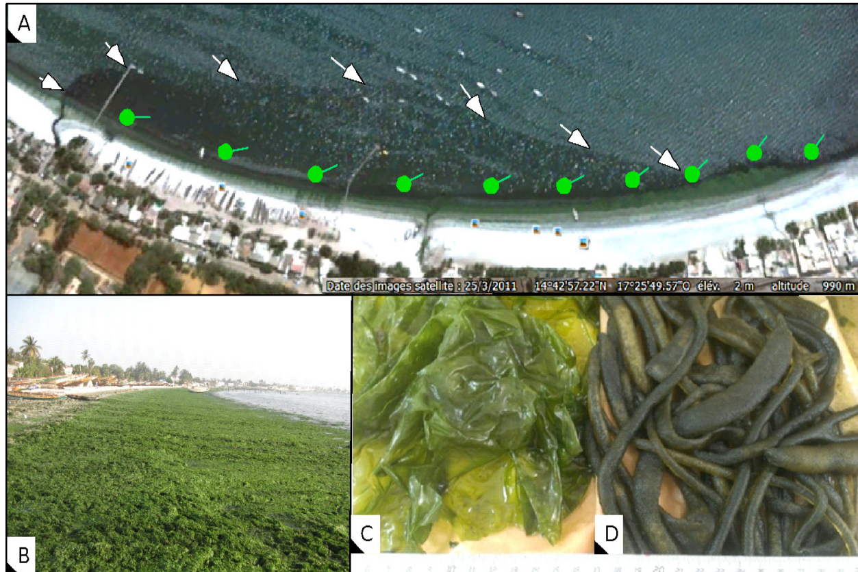
Figure 1: Origin and extent of the main macroalgae recovered from Hann Bay. Aerial view of the wastewater pollution (white arrows) resulting in the macroalgae proliferation (green circles with lines) in Hann Bay investigated in this study (A); Extent of the macroalgae (B); The two main species, Ulva lactuca (C) and Codium tomentosum (D), recovered.

Dakar's Hann Bay and Sangalkam, a town around 18 km from Dakar. In Nioro, Jatropha curcas cakes were sampled from an artisanal processing unit.