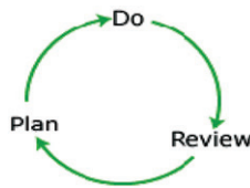
Figure 1. The basic three stage model of reflection.

'a form of mental processing with a purpose and/or anticipated outcome that is applied to relatively complex or unstructured ideas for which there is no obvious solution'.