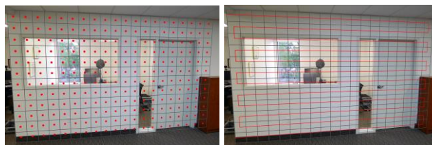
Figure 1: Grid with discrete points (left) and scanning path (right)

Field Indicators are compared against two criteria (adequate dynamic range, and adequate measurement array), (iii) the sound power is calculated; (iv) the ITL is calculated; (iv) the STC is calculated, and finally (vi) a basic coloured grid is created using Excel/PowerPoint to create a sound intensity map over the surface used for weakness detection.