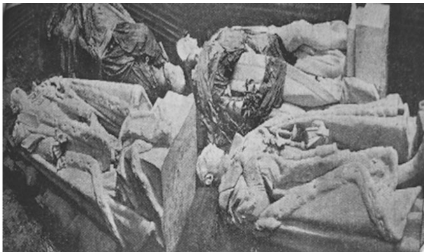
Figure 3. 'Paths of power lead but to the Museum', The Statesman , 11 July 1965. Image of British viceroys and generals 'dumped' at the Exhibition Ground.

statuary: Coronation Park, a site in the outer suburbs of Old Delhi which, appropriately enough, had staged George V's imperial darbar . The British were less convinced of the site's suitability. While conceding that statues placed in Coronation Park, 'might be out of sight and out of mind', in another sense, British officials worried that 'statues in this remote spot would not be looked after properly and that ill-disposed persons might easily mutilate them without anyone noticing for a long time'. 129